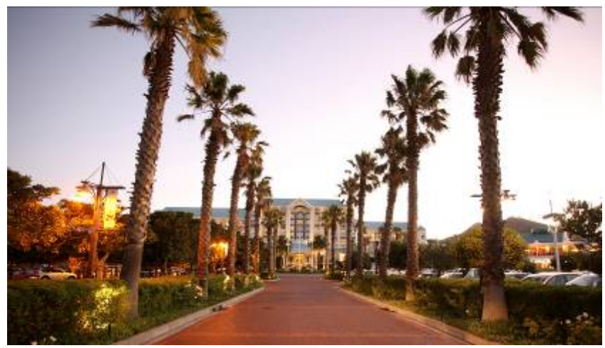
Table Bay Hotel

Accommodation: Table Bay Hotel – Luxury Twin Room