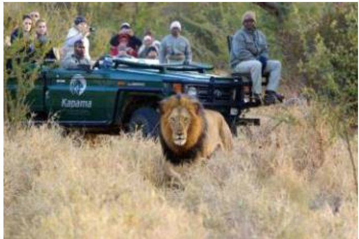
Open vehicle game drive

Accommodation: Kapama River Lodge – Spa Suite (B, L, D)