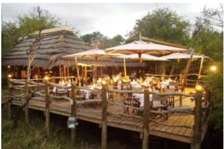
Kapama River Lodge

Kapama River Lodge is stylishly furnished and beautifully positioned along a dry riverbed. The ambience of nature is captured perfectly and guests fall in love with River Lodge the moment they arrive. Each spacious room at Kapama River Lodge features a full en-suite bathroom and patio with uninterrupted views into the leafy-green game reserve. Step onto your private balcony with a cool drink from your mini bar, and while away free time, gazing lazily into the bush for animals that may pass by, or have your early morning coffee in your room, watching the bush come alive with sound as the first rays fall.