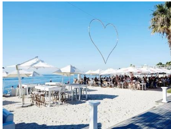
Grand Africa Café & Beach