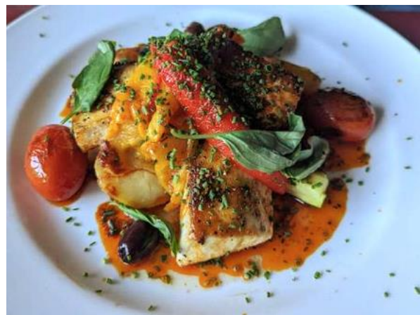
Black Sheep Restaurant