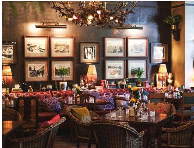
Kloof Street House Restaurant

This is where you can revel in the best of contemporary and traditional Italian meals at this elegant but unpretentious venue. The pasta, tortellini and gnocchi are all made from scratch. We recommend you try the spaghetti with raw tomatoes, capers and olives.