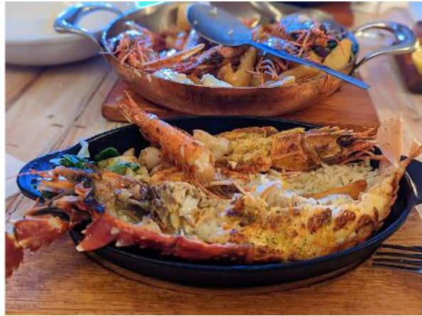
Codfather Camps Bay