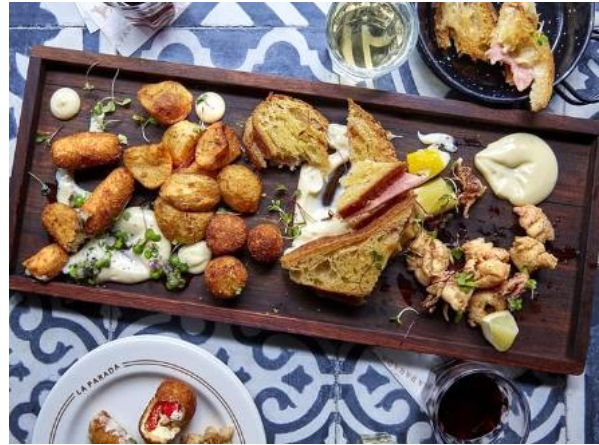
La Parada Constantia Nek