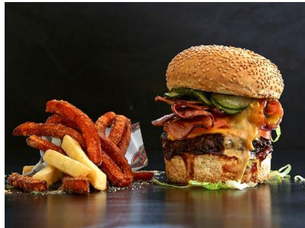
Gibson's Gourmet Burgers and Ribs

Gibson's has a reputation for being the best burger joint in town. You can dig into the highest quality, grain-fed, Karoo lamb, pork ribs and gourmet burgers. To wash it down, choose from almost 57 double thick milkshakes or craft beers. At the 40-foot bar, you can also order yourself an exotic cocktail. Gibson's really has it all.