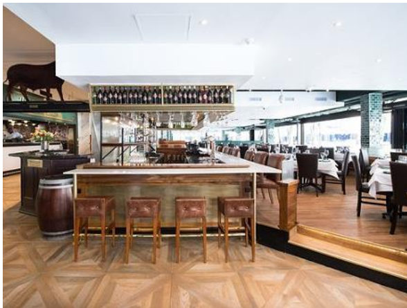
Butcher Shop and Grill

With the slogan "Raising the Steaks", it's not hard to understand why The Butcher Shop & Grill is a culinary Cape Town landmark. It is famous for its customized butchering. This is where the specialists in fine cuts will cut and prepare your meat, just the way you like it. The setting is where laughter and eating meet in jollity. For the very best in quality, The Butcher Shop & Grill is value for money.