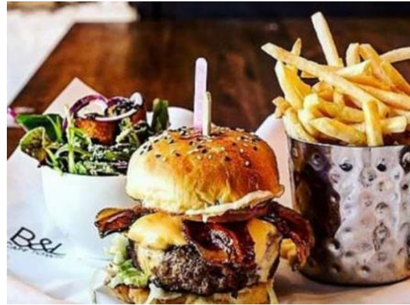
Burger & Lobster

You can taste the freshness in each delicious morsel, including the softest buns that are baked upstairs. The atmosphere is one of an enviable New York cocktail bar, a place to see and be seen, with high ceilings, modish decor and an open kitchen where you can watch passion being plated. The dessert menu features five moreish desserts that feature the famous Mississippi mud pie.