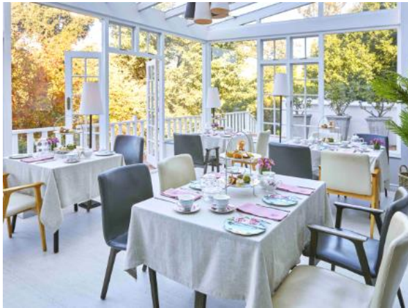
The Conservatory at Cellars-Hohenhort

The Conservatory at Cellars-Hohenhort is Cape Town's premier stylish restaurant. It's in the idyllic Constantia Valley and is set around a massive 300-year-old oak tree. They have a selection of firm favorites that include gourmet burgers, rib eye steaks, Cape Malay bobotie and Karoo lamb. If you aren't in the mood for indoor dining, then have your meal on the terrace that is usually illuminated in sunlight and overlooks verdant gardens.