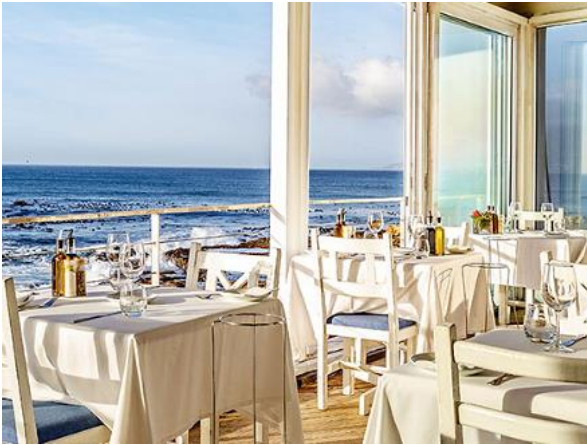
Harbour House Kalk Bay