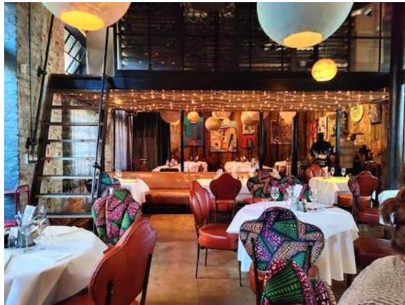
The Test Kitchen Fledgelings

It is a school for young chefs and offers a limited menu. This is a multi-sensory dining experience that plays on combinations and cooking techniques. The open plan kitchen means that you get to witness the creation and passion that goes into every dish.