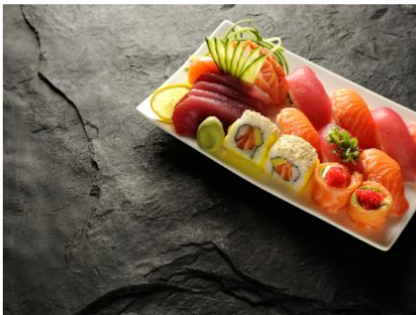
Willoughby and Co.

Willoughby & Co is within the V&A Waterfront premier shopping complex and serves an extensive range of ocean specialties. The finest sushi, the best in Japanese dishes and an oyster bar are on offer. Seafood lovers can also shop for their own fresh seafood and Japanese market products at the deli. There is also an in-house wine boutique to peruse with an extensive selection.