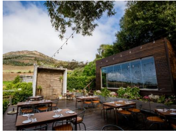
Chef's Warehouse at Beau Constantia