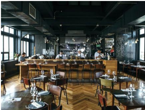
The Pot Luck Club

The Pot Luck Club is at the Old Biscuit Mill and is the realized vision of the famous chef Luke Dale Roberts. It's on the sixth floor of a silo at the complex and here you will find a casual menu focused on small plates. We highly recommend the beef fillet with chocolate and coffee sauce. It's not only about the locally sourced, quality food, that is presented like artwork on your plate; it's about the views that can be enjoyed from the expansive windows that showcase the mountain, ocean and city.