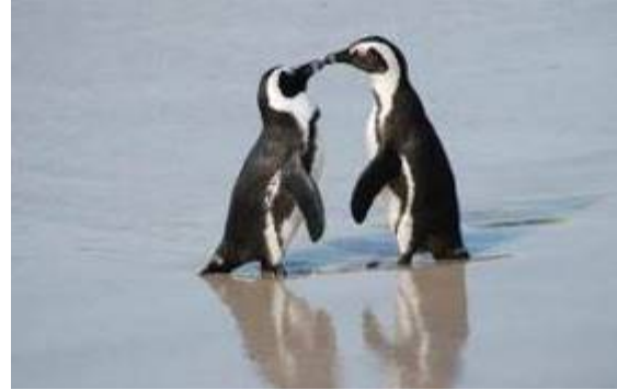
Boulders Beach Penguins

I would be happy to assist in pre-planning and arranging sightseeing tours to suit your interests. To see all of the day tour options that Lion World Travel has to offer, click here .