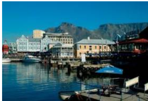
Victoria & Alfred Waterfront

Accommodation: Victoria and Alfred Hotel – Piazza Facing Room (B)