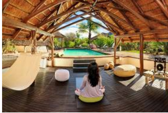
Villa Lobengula facilities

Accommodation: Shamwari Lobengula – Villa (B, L, D)