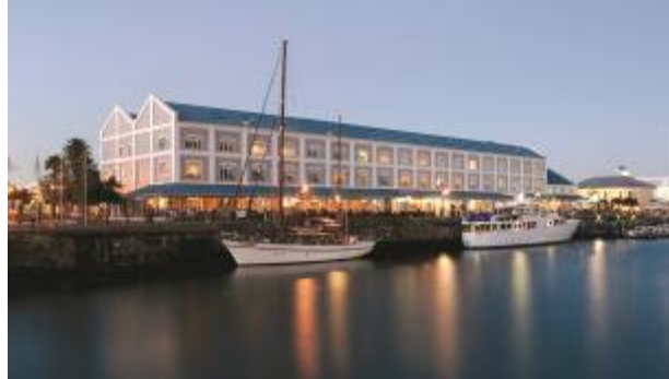
Victoria and Alfred Hotel

It's the precise details that give the Victoria & Alfred Hotel its elegance, intimacy, romance and reputation.