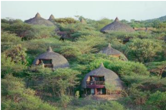
Serengeti Serena Lodge

Serengeti Serena Lodge offers comfortable rooms with awesome views across the sweeping plains. Inspired by a traditional African village, separate "rondavel huts" house the luxury en-suite guest rooms each with a balcony.