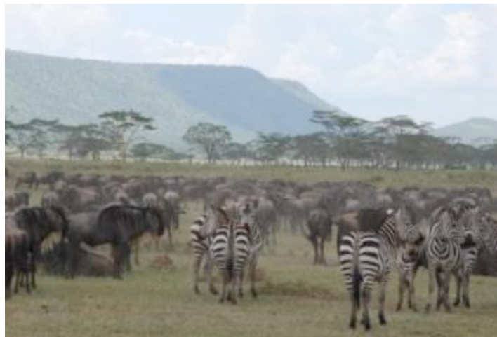
Game drive / wildlife

After breakfast descend through the early morning mist 2,000 feet into the crater for an awesome wildlife experience. Enjoy a picnic lunch at a scenic spot inside the crater, returning to the lodge in the late afternoon.