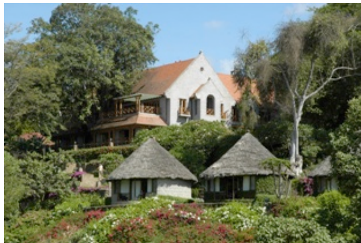
Lake Duluti Serena Lodge

Accommodation: Lake Duluti Serena Lodge – Standard Room (D)