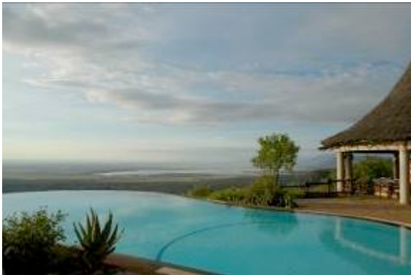
View from Lake Manyara Serena Lodge

It would be difficult to find a more dramatic setting than the 4-star Lake Manyara Serena Lodge which is situated at the edge of an escarpment and overlooks both the Great Rift Valley and the beautiful lake of Manyara. The lodge offers a unique blend of tranquillity, wildlife discovery and ornithological richness.