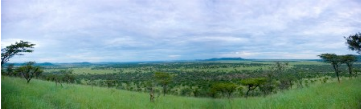
Endless Serengeti Plains