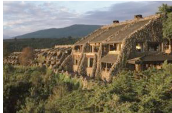
Ngorongoro Serena Lodge

Stay at Ngorongoro Serena Lodge, with its blend of luxury and ethnic style and offering stunning views.