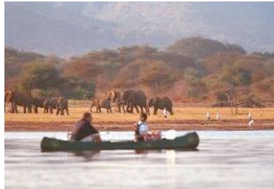
Canoeing on Lake Manyara

The rooms are housed in white-washed 'rondavels' (traditional circular buildings with thatched roofs), which are situated along the edge of the cliff so as to allow for maximum views. Each spacious room has its own small veranda while the interior décor reflects the blue of the lake and the pink of its flamingos. Facilities in the rooms include telephone and Wi-Fi, hairdryers, toiletries, bathrobe and slippers.