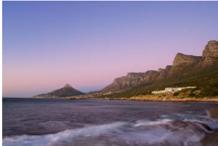
Twelve Apostles Hotel and Mountain Range

Accommodation: Twelve Apostles Hotel & Spa – Luxury Room (B)